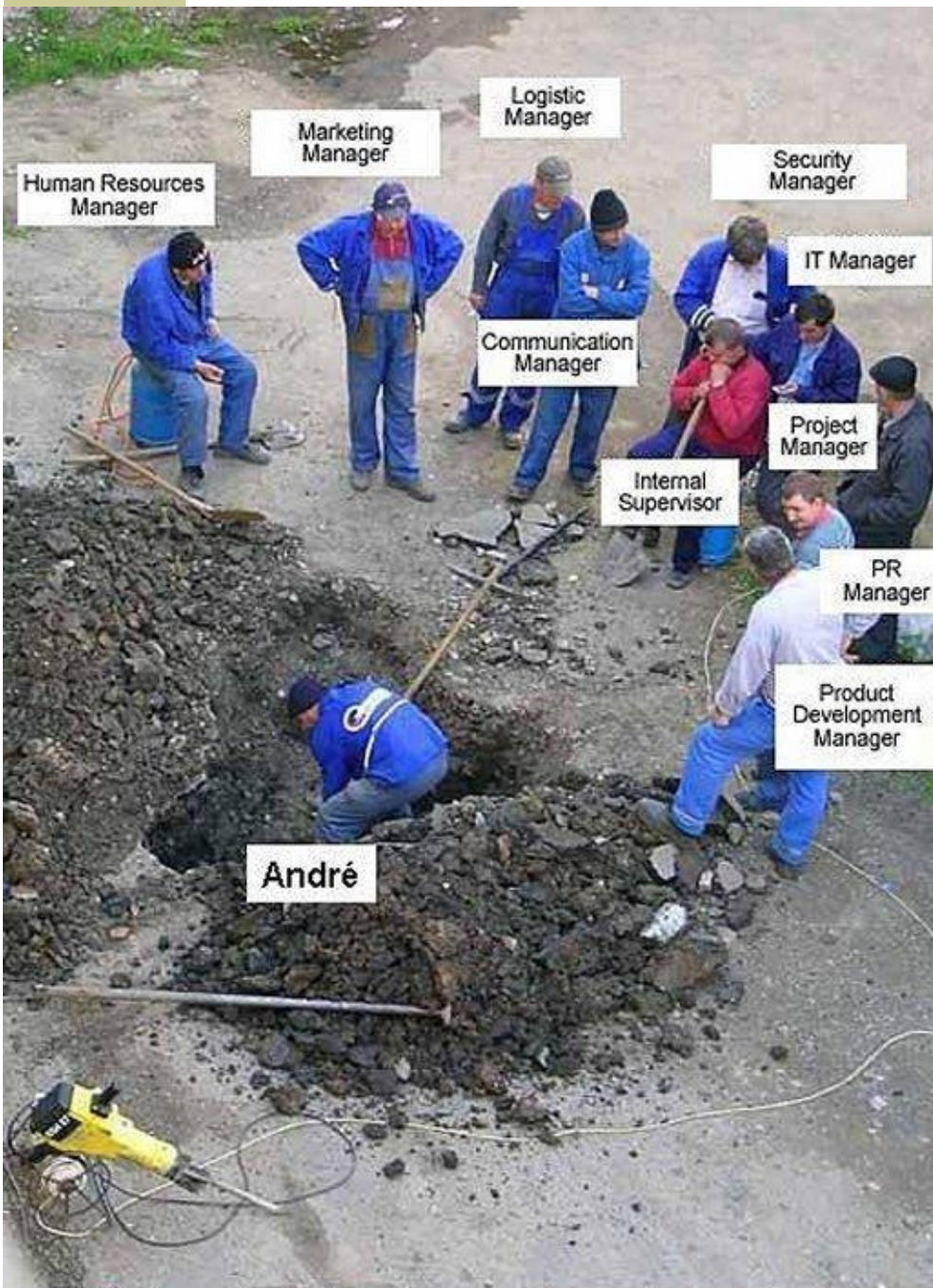
This financial crisis is forcing companies to make tough decisions;